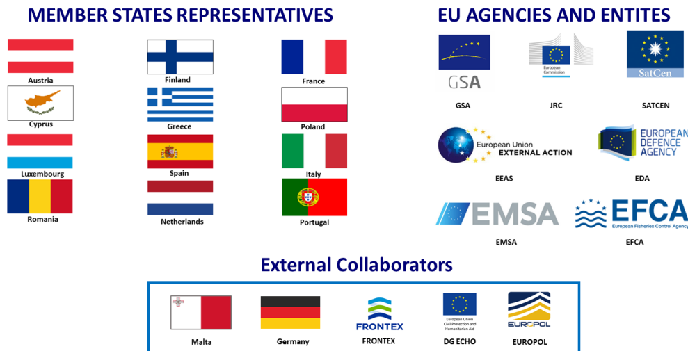
Figure 1 – ENTRUSTED Project Consortium and External Collaborators (status April 2021)

The project consortium, led by the European Global Navigation Satellite Systems Agency (GSA) 1 , includes EU Member State representatives and EU Agencies which help in conducting the survey and will support you as needed to answer this survey. The current members of the consortium and the collaborators are shown in the figure below.